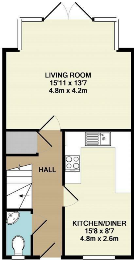
GROUND FLOOR APPROX. FLOOR AREA 450 SQ.FT. (41.8 SQ.M.)